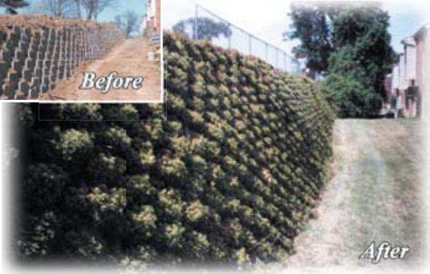
Apartment community tie wall replacement