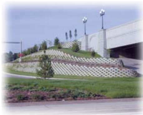
High finish urban interchange.