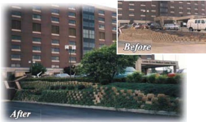
Terraced wall planted with Vinca Minor Vines.