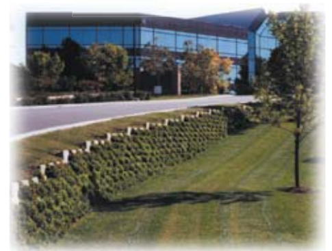
Office parkway entrance planted with "Sedum".