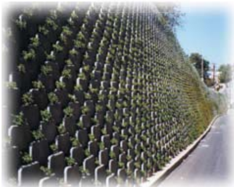
Retail strip center, reinforced wall heights up to 32 feet.