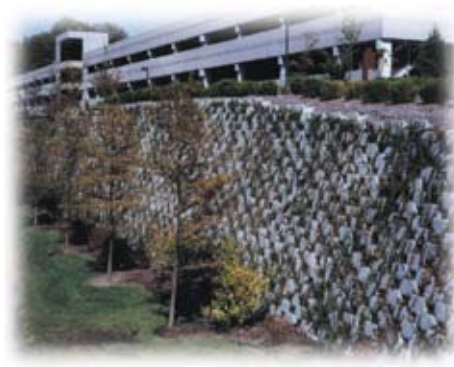
Corporate headquarters, gravity wall up to 18 feet tall.