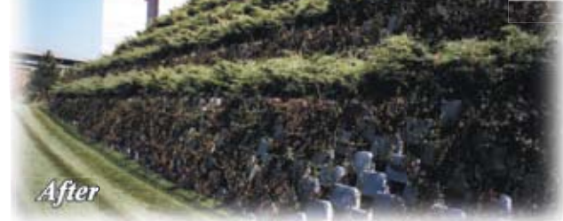
Parking lot expansion vegetated with Euonymus vines.