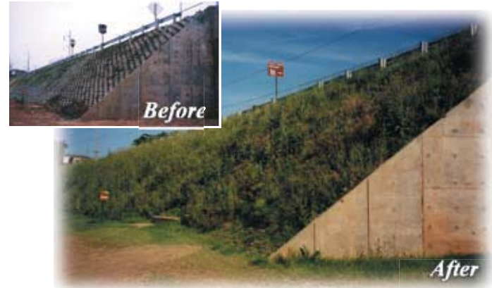
Roadway lane expansion project with reinforced soil slope up to 30 feet tall, spray seeded with native material.