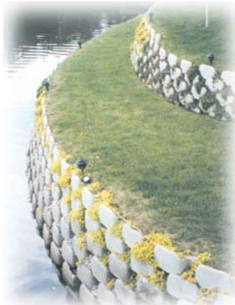
Lakefront sea wall on residential ski lake